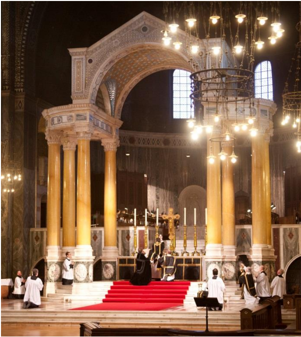
Solemn Mass for Deceased Members Westminster Cathedral