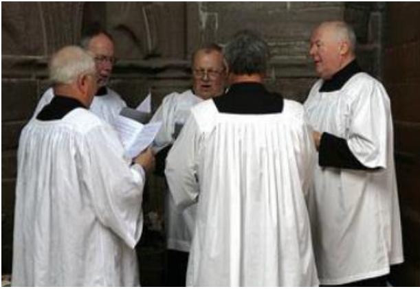
The Cantors of the Holy Rude