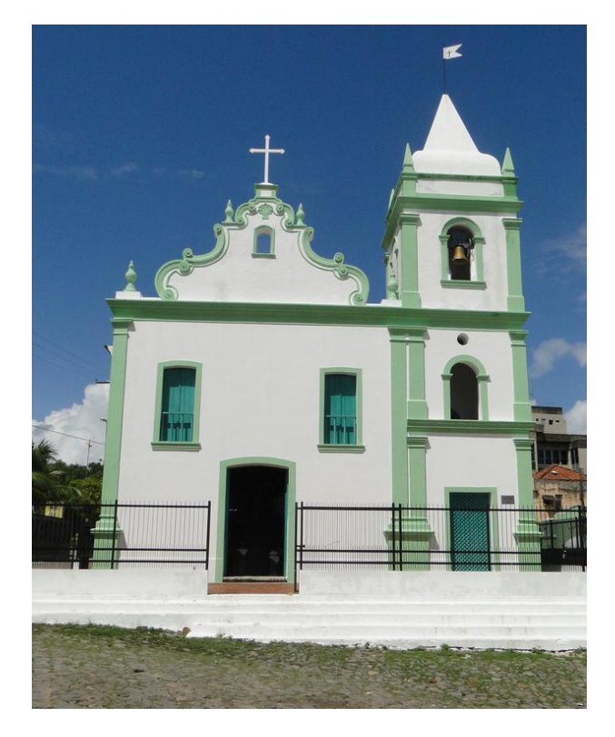
Church of Nossa Senhora do Rosário dos Pretos, Natal, Brazil

The city of Natal, in north eastern Brazil, was founded by Portuguese settlers on December 25, 1599 – hence its name, which means Christmas in Portuguese.