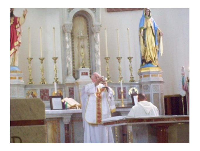
Holy Mass at Parroquia San Jose

Also in December 2009, a second venue was inaugurated at "Parroquia San Jose", in the same Archdiocese. Subsequently, a third venue was established at "Parroquia Protomártires de la Inmaculada Concepción" in the city of Aguada and belonging to the Diocese of Mayaguez. The Traditional Latin Mass is currently offered at the first and third venues, once a month in each parish.