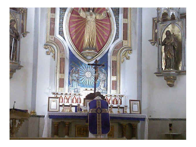
Holy Mass at Parroquia San Jorge

The admission of Puerto Rico in the FIUV in July 2012 was the culmination of contacts and conversations initiated in December 2009. The Traditional Latin Mass was already being celebrated since early 2007, months before Summorum Pontificum was promulgated. The original venue was "Parroquia San Jorge", located in the capital city of San Juan, within the jurisdiction of the Archdiocese of San Juan.